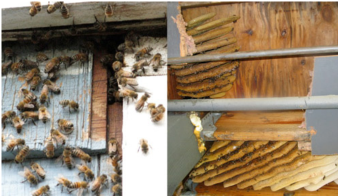
Figure 13. Nuisance colonies of European honey bees, Apis mellifera Linnaeus. Left: worker honey bees at the entrance of a colony in the exterior wall of a house. Right: the underside of a carport roof has been cut away to expose the wax combs of a colony.

Honey bee colonies themselves also can be considered a pest when a feral swarm establishes a new colony in an undesirable location, such as the wall of a house, a mail box, or some other location where they will come into frequent contact with humans (Figure 13). In this case, a trained professional ( https://edis.ifas.ufl.edu/in771 ) or beekeeper should be contacted to remove the nuisance colony.