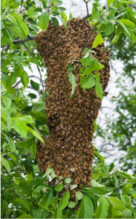
Figure 11. A reproductive swarm of European honey bees, Apis mellifera Linnaeus, coalesced on a tree branch while scout workers search for a place to establish the new colony.

remainder of her life. Once successfully mated, the daughter queen begins laying eggs, thus completing both halves of the swarming process.