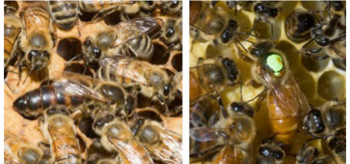
Figure 4. An unmarked queen European honey bee, Apis mellifera Linnaeus (left), and a queen who has been marked with a small dab of paint (right) on comb.

The queen honey bee (Figure 4) is the only reproductive female in the colony during normal circumstances (some workers can lay unfertilized male eggs in the absence of a queen). Her head and thorax are similar in size to that of the worker. However, the queen has a longer and plumper abdomen than does a worker. The queen also has a stinger but its barbs are reduced. Consequently, she does not die when she uses it.