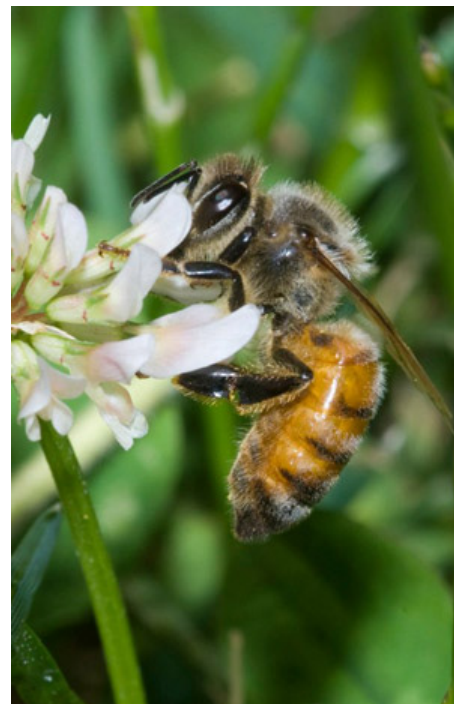
Figure 8. Worker European honey bee, Apis mellifera Linnaeus, foraging on a flower. Note hairs covering the body and the “waist” created by the constriction of the second abdominal segment.