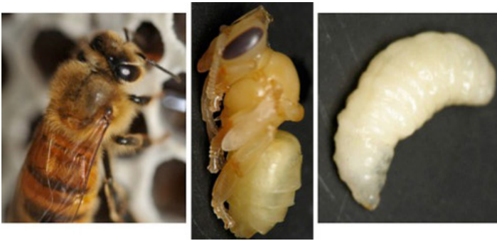
Figure 6. Life stages of a honey bee: adult (left), pupa (middle), larva (right).