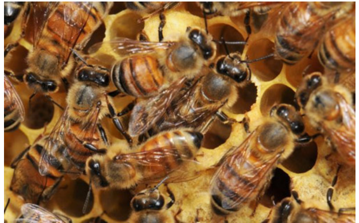
Figure 1. European honey bees, Apis mellifera Linnaeus, on comb in a colony.

In the United States, “European” honey bees (Figure 1) represent a complex of several interbreeding European subspecies, including: Apis mellifera ligustica Spinola, Apis mellifera carnica Pollmann, Apis mellifera mellifera Linnaeus, Apis mellifera caucasica Pollmann, and Apis mellifera iberiensis Engel. Introduction of these subspecies dates back to early American settlers in 1622. More recently (late 1950s), a subspecies of African honey bee , Apis mellifera scutellata Lepeletier, which can interbreed with European subspecies, was introduced into the Americas.