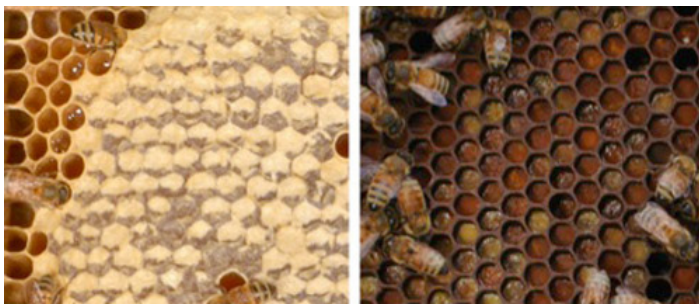
Figure 9. Honey (left) and pollen (right) being stored in wax comb within the colony.

In the honey bee colony, labor is divided among individuals based on caste and age. A drone's only purpose is to mate with a virgin queen from another colony. The queen is the sole egg layer in the colony and is responsible for producing all of the colony's offspring (up to 1500 eggs/day). Worker honey bees are thusly named because they perform all colony maintenance tasks. Each worker will perform different tasks exclusively in a predictable order based on their age. This is called age-related polyethism. The youngest workers tend the brood (eggs, larvae, and pupae) while older workers build wax comb, handle food stores within the colony (Figure9), and guard the colony entrance. The oldest workers are foragers; these are the honey bees people encounter most.