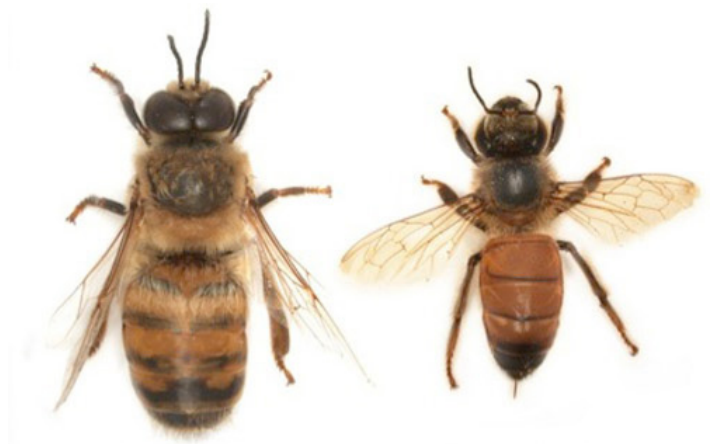
Figure 5. Drone (male) European honey bee, Apis mellifera Linnaeus on the left and a worker European honey bee on the right.

Drones are the male caste of honey bees. The drone's head and thorax are larger than those of the female castes, and their large eyes appear more 'fly-like,' touching in the top center of the head. Their abdomen is thick and blunt at the end, appearing bullet-shaped rather than pointy at the end as with the female castes (Figure 5).