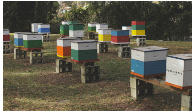
Figure 12. An apiary of managed European honey bee, Apis mellifera Linnaeus, colonies in Langstroth hives.

Honey bee management is popular worldwide and varies greatly in style and scale. Commercial beekeepers may maintain 2,000 or more colonies, whereas a hobbyist beekeeper may have a few as 1. The equipment used to house honey bee colonies is also very diverse. Some of the more popular equipment styles include skeps, top bar, log gum, and Langstroth hives, with the Langstroth hive being the most widely used in the United States (Figure 12). The Langstroth hive features interchangeable boxes (supers) with removable frames (combs) that allow for colony inspection, pest/disease treatment, and honey collection without destroying the colony.