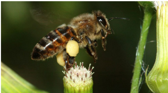
Figure 2. Worker European honey bee, Apis mellifera Linnaeus, with pollen stored in the corbicula of both hind legs.

Worker honey bees are non-reproductive females. They are the smallest in physical size of the three castes and their bodies are specialized for pollen and nectar collection. Both hind legs of a worker honey bee have a corbicula (pollen basket; Figure 2) specially designed to carry large quantities of pollen back to the colony. Worker honey bees produce wax scales on the underside of their abdomen. The scales are used to construct the wax comb within the colony (Figure 3). Workers have a barbed stinger that is torn, with the poison sac, from the end of their abdomen when they deploy the sting into a tough-skinned victim. This results in the worker bee's death.