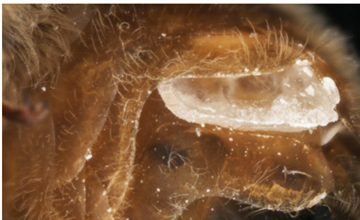
Figure 3. Wax scale being produced from the underside of a worker European honey bee's, Apis mellifera Linnaeus, abdomen.

The queen honey bee (Figure 4) is the only reproductive female in the colony during normal circumstances (some workers can lay unfertilized male eggs in the absence of a queen). Her head and thorax are similar in size to that of the worker. However, the queen has a longer and plumper abdomen than does a worker. The queen also has a stinger but its barbs are reduced. Consequently, she does not die when she uses it.