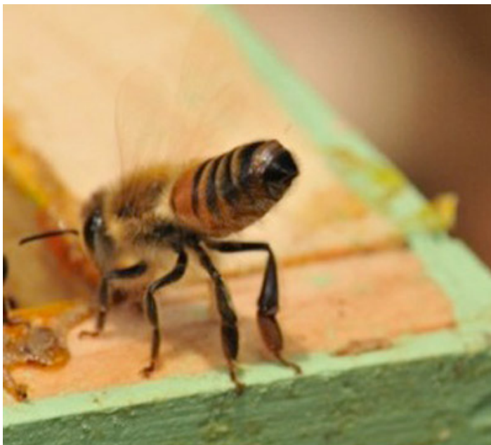
Figure 10. Worker European honey bee, Apis mellifera Linnaeus, exposing the Nasanov gland at the tip of the abdomen and fanning her wings to release Nasanov pheromone when the colony was disturbed by removing the lid.