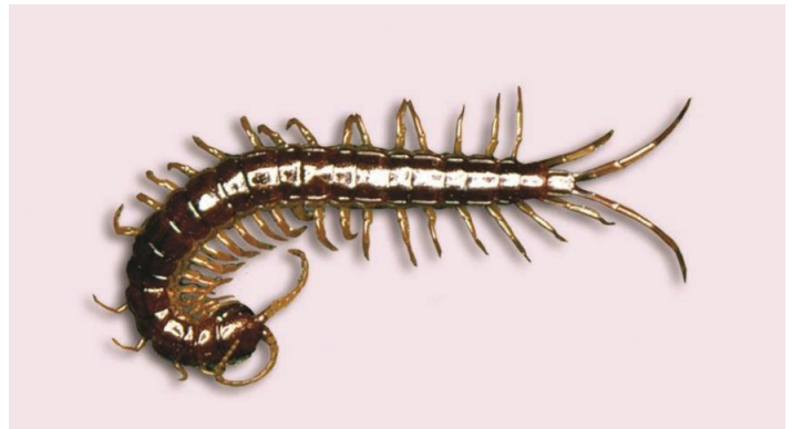
Figure 3. Centipede.

Centipedes (Figure 3) are many-legged animals (ranging from 10 to 100 depending on species) and belong to a group of animals called chilopods. They are usually brownish, flattened animals with many body segments, with most body segments having one pair of legs. Centipedes are fast runners and may vary in length from 1 to 6 inches (2.5 to 15 cm). They have one pair of antennae, or “feelers,” that are easily seen. Centipedes have poorly developed eyes and are most active at night. They are active predators feeding mainly on insects and spiders. All centipedes have venom glands to immobilize their prey, but the toxicity of the venom is not enough to be lethal to humans. The jaws of the smaller local species cannot penetrate human skin; however, the larger species may inflict painful bites.