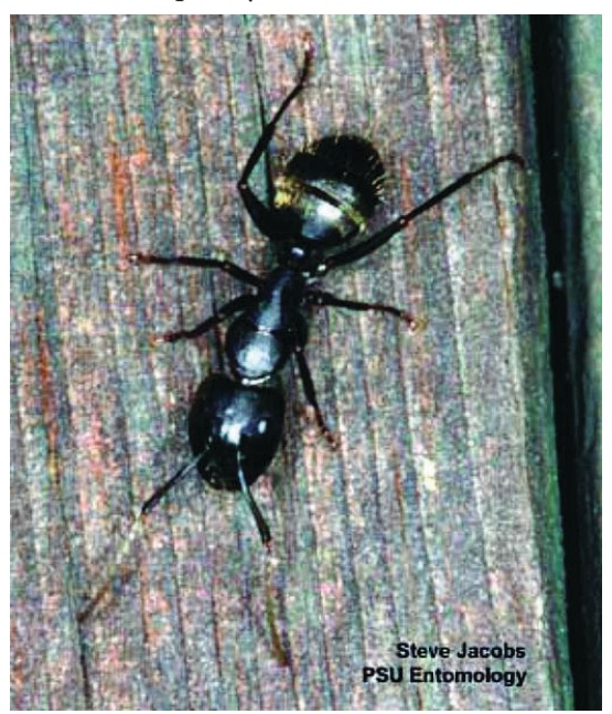
Figure 2. A black carpenter ant adult worker.

the structural integrity of their homes, which they sometimes have misidentified as caused by Florida carpenter ants. However, unlike the wood-damaging black carpenter ant, found in Florida's Panhandle, and a few other western US species, Florida carpenter ants seek either existing voids in which to nest or excavate only soft materials such as rotten or pithy wood and Styrofoam. The main nests for the black carpenter ant (Figure 2) are usually found outside, with satellite nests found indoors within voids or under insulation. Carpenter ants are primarily nocturnal in their foraging behavior. Carpenter ants do not sting but they do bite and can spray formic acid into the fresh wound if the ant is not removed quickly.