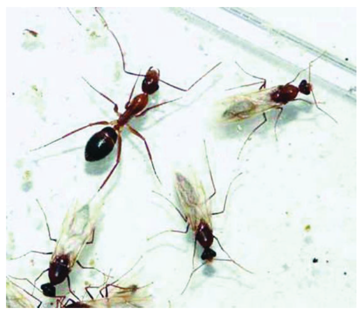
Figure 5. Worker and male reproductives of the Tortugas carpenter ant. Notice that the worker's head is longer than broad.