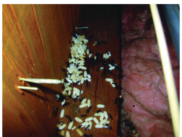
Figure 9. Carpenter ants in an attic space.