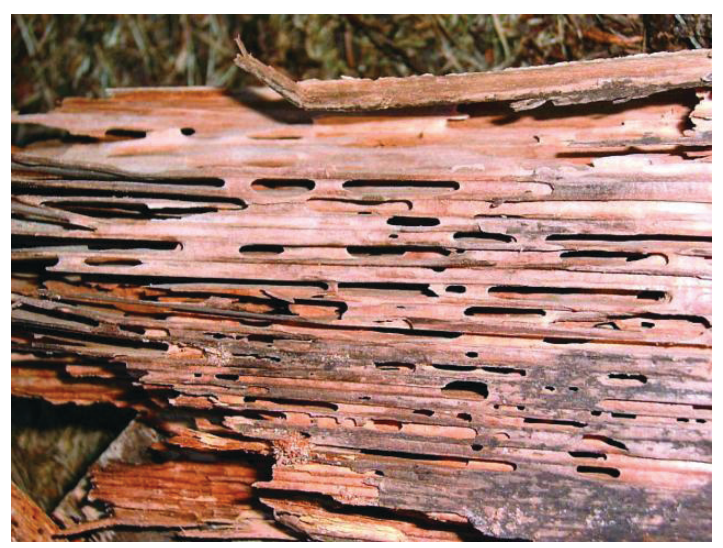
Figure 10. Carpenter ant damage to wood.

Cultural control practices entail using nonchemical materials to eliminate or exclude carpenter ants from infesting a structure. Repairing leaky pipes, caulking entry points, and removing damaged wood (Figure 10) are examples of cultural control practices. Eliminate "bridges" caused by trees and shrubs touching house exteriors. If wires or power cables are being used as bridges, it may be possible to have a professional treat the wires or areas where the wires attach to the structure. There are a number of "pest barrier" substances available that are sticky and can be used on tree trunks and other places to stop ants from passing. Using building materials designed to exclude carpenter ants in a structure is another example of a preventive strategy. Certain man-made lumbers have plastics incorporated into the product, making this lumber ideal for use in exterior structures such as decks. Insulation materials are also manufactured with impregnated borates and other compounds that repel or kill carpenter ants.