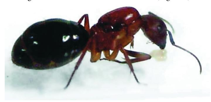
Figure 6. Florida carpenter ant dealate queen tending her brood.

Carpenter ants develop through complete metamorphosis, going through stages of the egg, larva, pupa, and adult worker or reproductive (alate). Carpenter ants create new colony sites when winged male and female reproductives emerge from a nest and depart for a mating flight. The mating flights of carpenter ants take place in the spring and are triggered by environmental factors such as photoperiod and changes in temperature. Winged reproductives fly in the evening or night during the rainy season (May through November). At the conclusion of a mating flight, the newly fertilized queen falls to the ground, breaks off her wings, and begins her search for a suitable nest site (Figure 6).