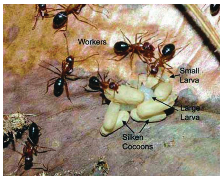
Figure 7. Adult workers and brood (larvae and pupae) of the Florida carpenter ant.

the first brood are called minims or minors and have very little size variation. These workers will forage, feed and groom the queen, maintain the nest, and assist with brood care (Figure 7). The developmental cycle from egg to adult ranges from 50 to 70 days. The colony will continue to grow, and populations may reach several thousand workers.