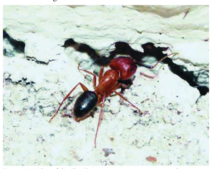
Figure 8. Worker of the Florida carpenter ant entering a void.

Observation of foragers entering voids is the best means of finding indoor nests (Figure 8). Watch for trailing ants at their peak nocturnal foraging hours and follow them. Look for areas of higher ant population density indicating closer proximity to the nest. The presence of ants and sawdust in crawlspaces and/or attics in a home also indicate an infestation (Figure 9). If alates emerge in a home during the winter or early spring, one can assume that there is an interior nest. If carpenter ant workers are found inside the home only in warm months, they may be scout ants from an outside nest. Nontoxic baits such as sugar milk, sugar water, honey, or dead insects placed along a foraging trail can cause other nestmates to be recruited to the area. Try to follow the foragers back to the nest and then treat the nest.