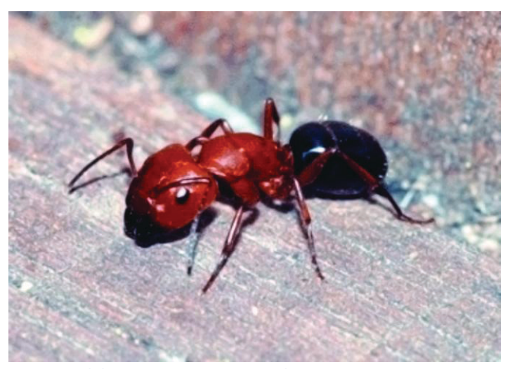
Figure 1. Adult carpenter ant major worker.

in the genus Camponotus are true carpenter ants because some nest in preformed cavities or in soil. Two carpenter ant species that are common around structures in the South are the Florida carpenter ant and the Tortugas carpenter ant. These bicolored arboreal ants are among the largest ants, making them apparent as they forage or fly indoors and out (Figure 1).