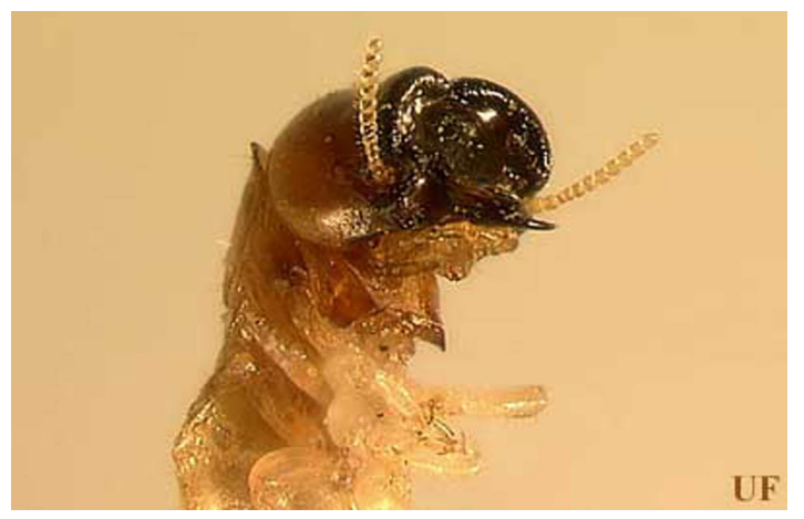
Figure 2. A close-up view of a Cryptotermes cavifrons soldier's head shows the pluglike, or phragmotic, head that is characteristic of the genus. The dorsal, posterior surface of the head is smooth, characteristic of the species.

Alates are approximately 8.5 to 9.7 mm long, including wings. The head and body are dull, pale brown. The width of the head is less than 1 mm, and the antennae are much longer than the head, with 10 to 14 (usually 11 or 12) segments. The wings have three to four sclerotized (hardened and thickened) veins visible in the third of the wing closest to the body. The forewings also have an unsclerotized median vein that curves upward to the sclerotized veins about midwing. The wings are long, with the tip of the abdomen often reaching only about halfway down the length of the wing. The wing scale (the darkened base of the wing where it attaches to the body) is often about the same length as the pronotum.