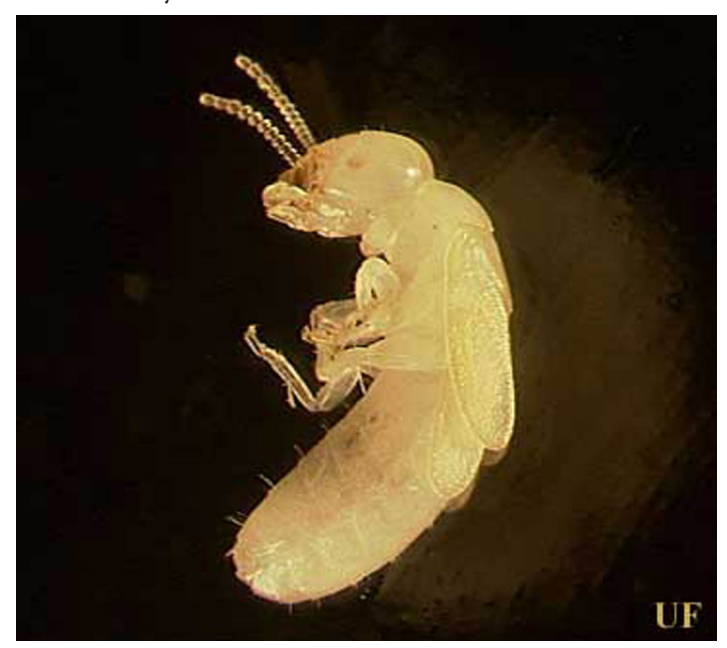
Figure 5. The presence of wing pads indicates that this Cryptotermes cavifrons individual is a nymph. Eventually it will develop into an alate, or swarmer, with wings and reproductive capabilities.

After the eggs hatch into larvae and go through about three molts, the young begin the process of separating into castes. Some molt into presoldiers, which resemble soldiers in form but are unsclerotized and thus white in color. Others become nymphs, which will eventually develop into winged reproductives, or alates. Other larvae molt to become the worker class of the colony, taking care of excavating galleries keeping the soldiers fed. Drywood termite pseudergates are different from subterranean termite workers in that they can continue to develop into alates should a need arise in the colony. In the family Termitidae, workers are sterile adults, and the path to that caste is a one-way street. Once a worker, always a worker.