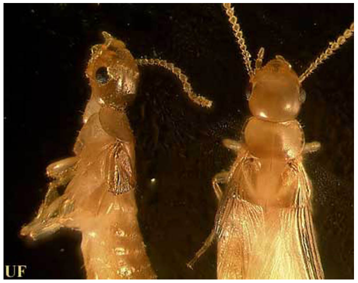
Figure 6. The Cryptotermes cavifrons dealate on the left has already broken off its wings. Note that the scales where the wings attached to the body remain in place. They are about the same length as the pronotum.

When alates land, they twist off their wings, find a mate and burrow into a suitable location in the wood such as a knothole or crevice and mate. Alates who have broken off their wings are called dealates. Eggs then take several months to hatch.