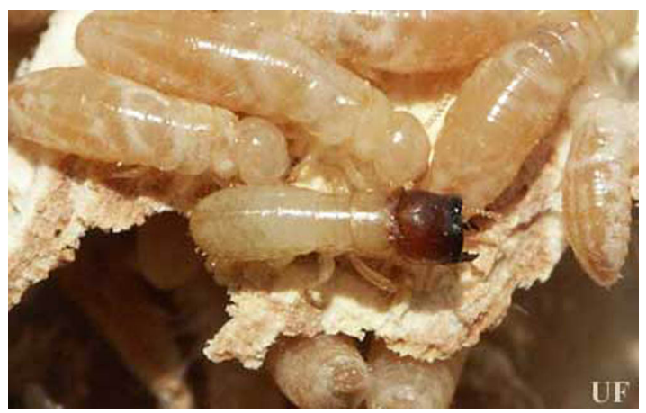
Figure 1. A Cryptotermes cavifrons soldier, recognizable by its sclerotized and darkened head, is surrounded by workers. Soldiers make up only 1-2 percent of the typical Cryptotermes cavifrons colony.