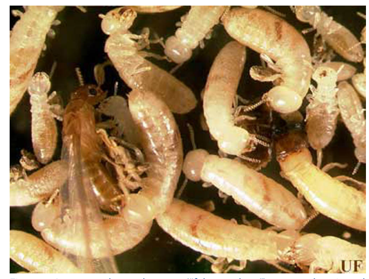
Figure 4. Larvae and pseudergates ("false workers") surround a winged reproductive (alate), left, and soldier, right. Soldiers make up only 1-2 percent of the typical Cryptotermes cavifrons colony.

Drywood termites, like all termites, are eusocial insects. They live in colonies and cooperatively care for young. Responsibilities for reproduction, foraging and colony defense are divided up among castes: reproductives (king, queen and alates), workers and soldiers. In drywood termites, the "worker" caste does not consist of true workers that are reproductively sterile and found in the higher termites of the family Termitidae. Rather, immature termites do the labor of the traditional worker caste, and they are known as pseudergates ("false workers"). All the castes have chewing mouthparts, although the mandibles of the soldiers are greatly modified for defense to the point that they must be fed by the pseudergates. All but the reproductives are blind.