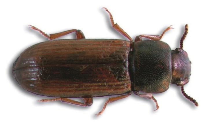
Figure 1. Flour beetle.

the pantry shelves. Moths and beetles are often attracted to lights or windows and may indicate an infestation. The presence of stored food pests is not an indication of uncleanliness, since infestation may be brought home in purchased food.