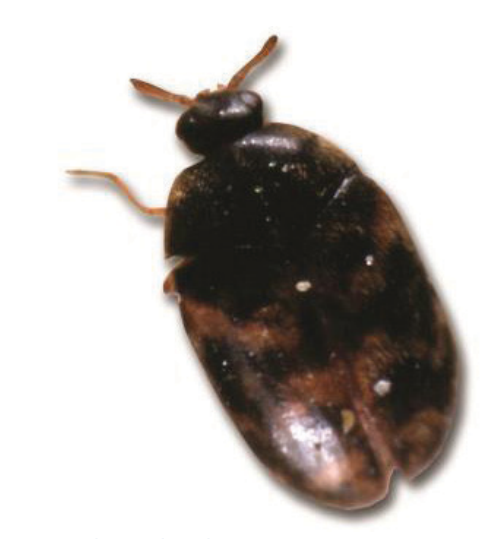
Figure 12. Warehouse beetle.