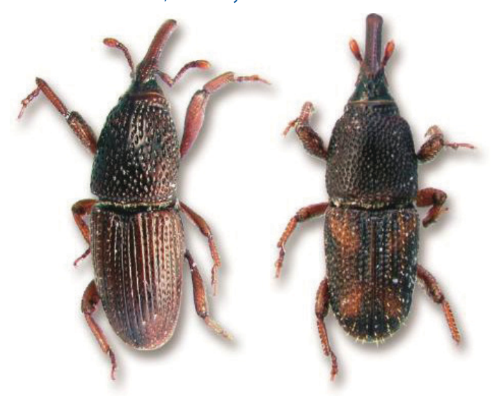
Figure 5. Granary weevil and rice weevil.