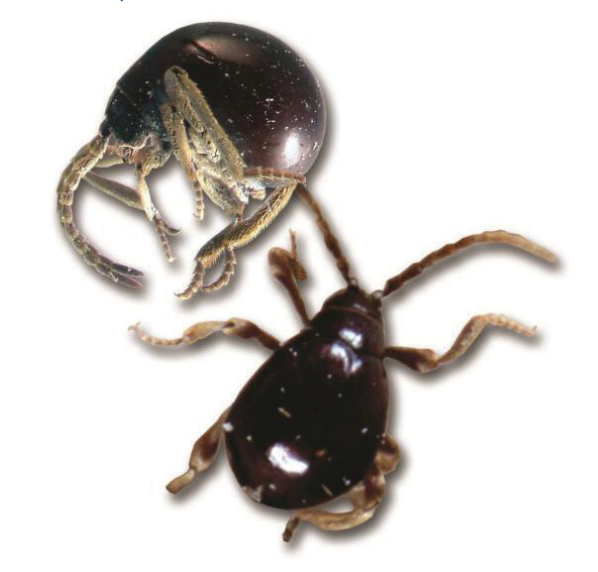
Figure 6. Spider weevil, side and dorsal views.