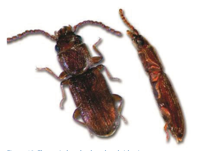
Figure 13. Flat grain beetle, dorsal and side views.