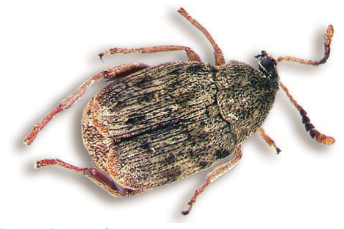
Figure 11. Bean weevil.