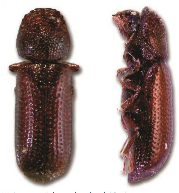
Figure 10. Lesser grain borer, dorsal and side views.