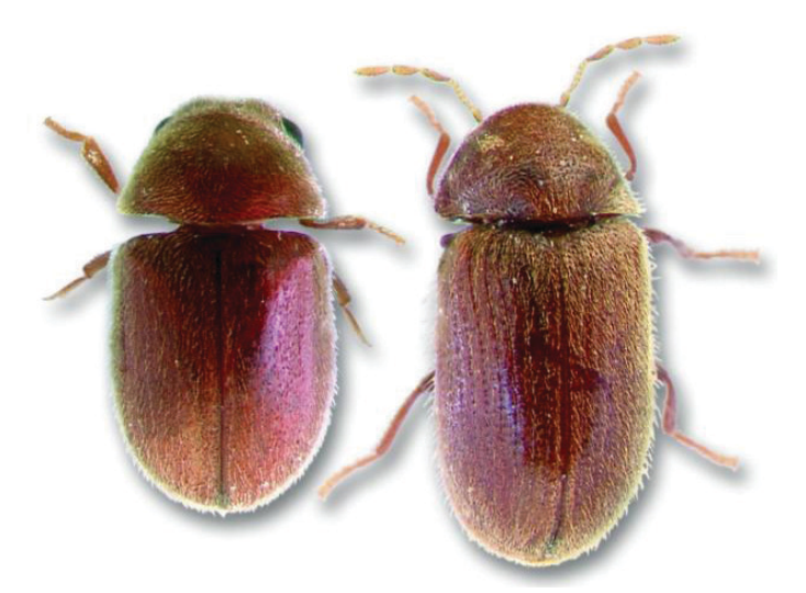
Figure 3. Cigarette beetle and drugstore beetle.