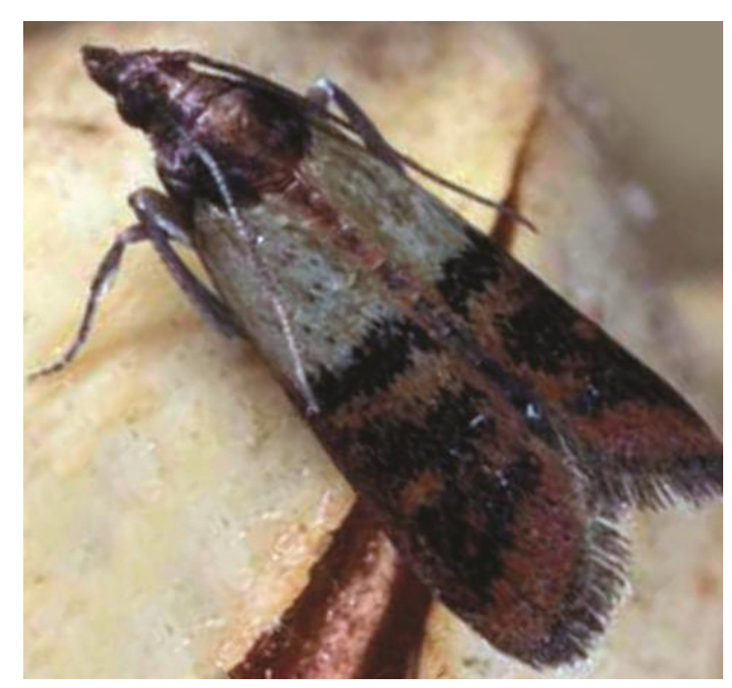
Figure 9. Indian meal moth, also known as flour moth.