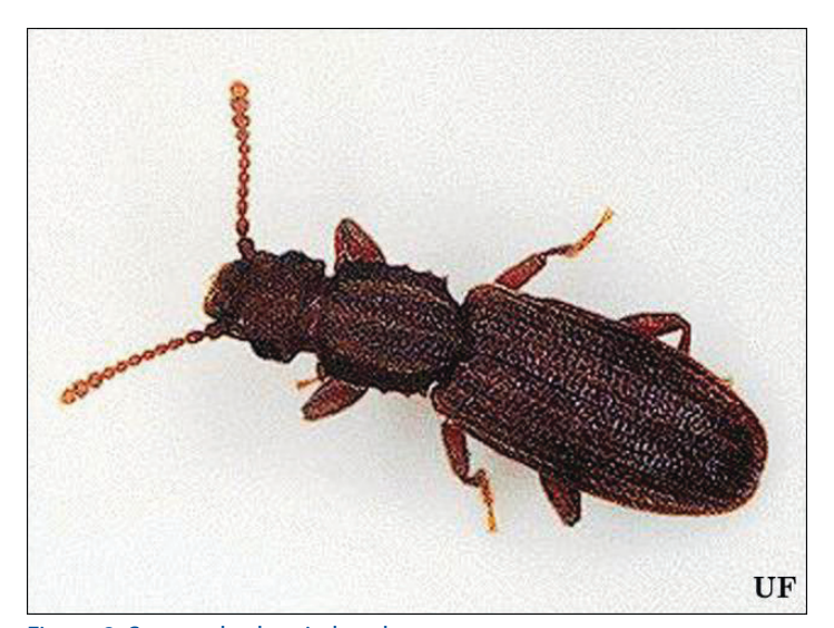
Figure 2. Sawtoothed grain beetle.