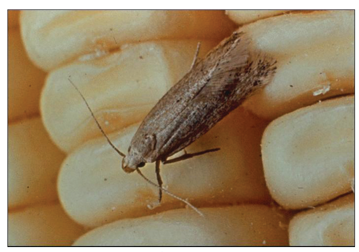
Figure 7. Angoumois grain moth.