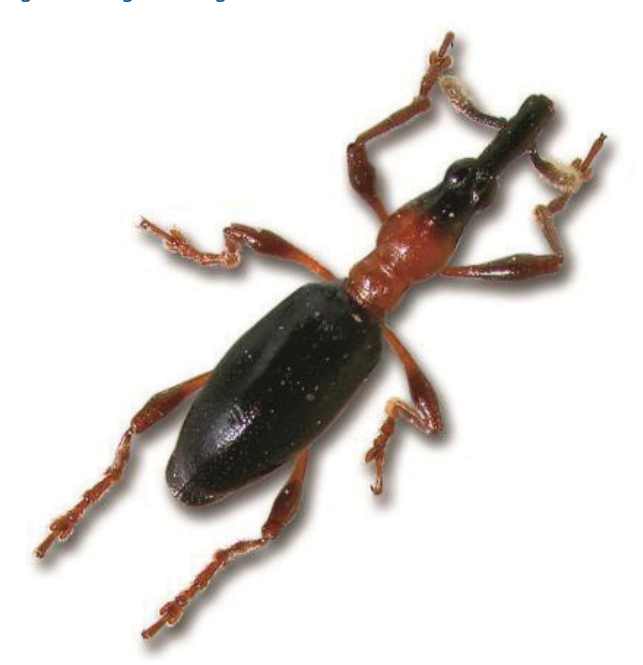
Figure 8. Sweet potato weevil.