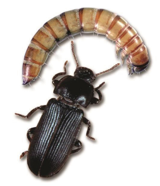
Figure 4. Mealworm larva and adult.